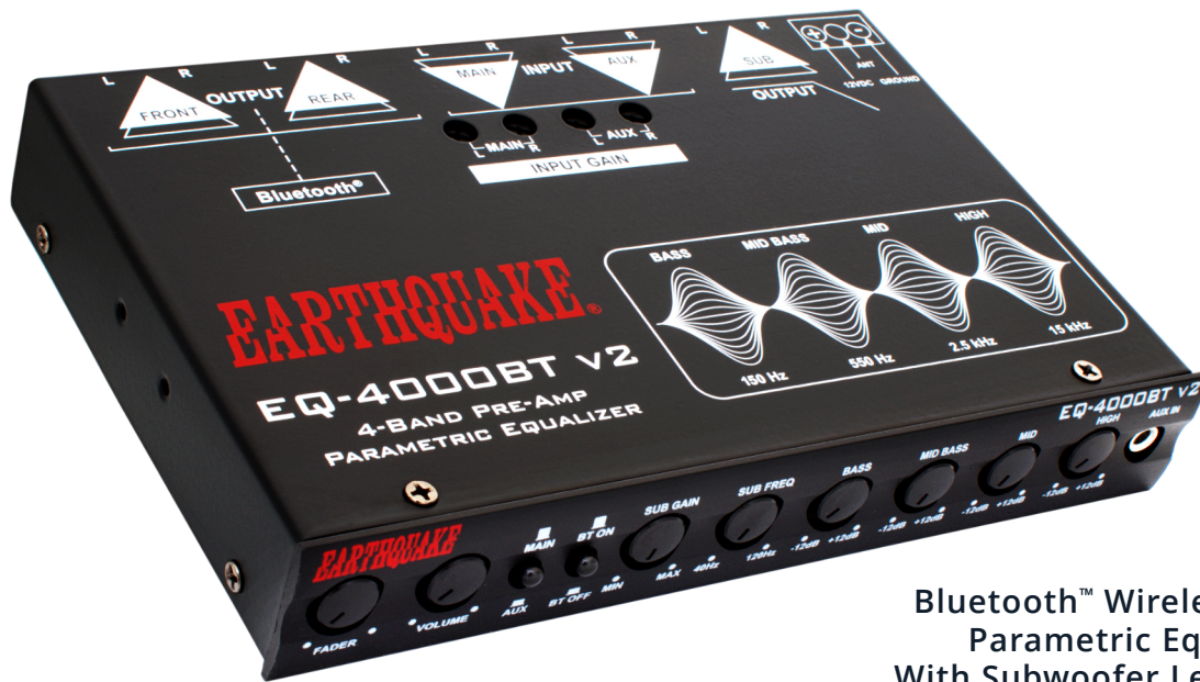
Bluetooth™ Wireless 4-Band Parametric Equalizer With Subwoofer Level Control