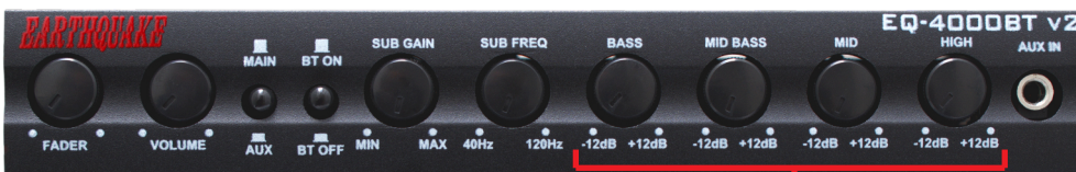
Fine Tune Your Music With Superior Control Across 4 Bands From 150Hz-16kHz